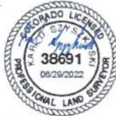
ILLUSTRATION ATTACHED AND MADE A PART HEREOF.